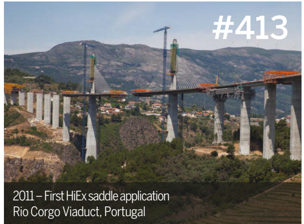
2011 – First HiEx saddle application Rio Corgo Viaduct, Portugal