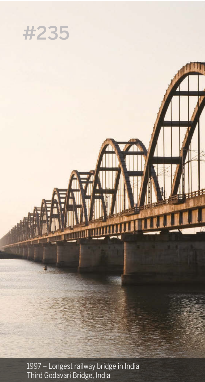
1997 – Longest railway bridge in India Third Godavari Bridge, India