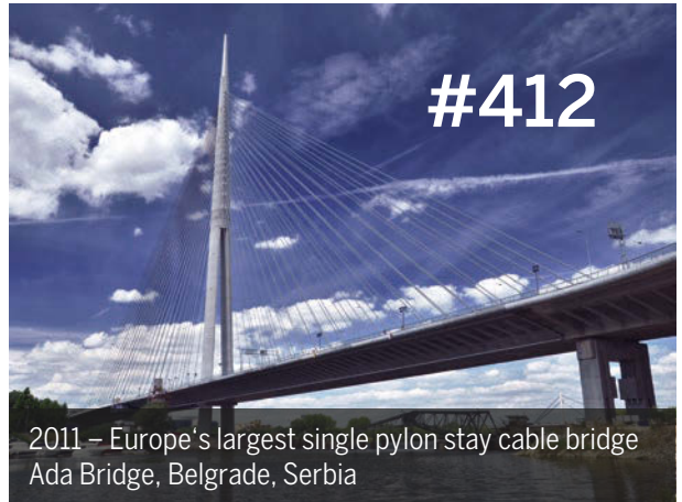
2011 – Europe's largest single pylon stay cable bridge Ada Bridge, Belgrade, Serbia