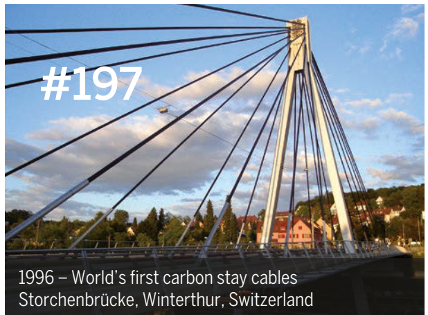
1996 – World's first carbon stay cables Storchenbrücke, Winterthur, Switzerland