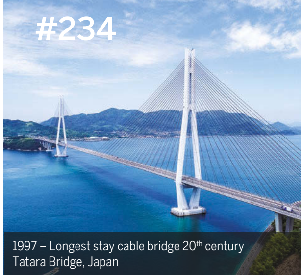
1997 – Longest stay cable bridge 20 th century Tatara Bridge, Japan